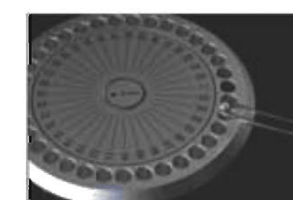
Sample loading carousel