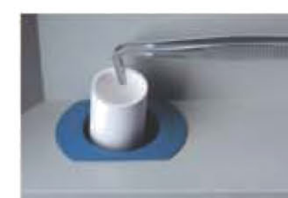
Automatic combustion crucible introduction and removal